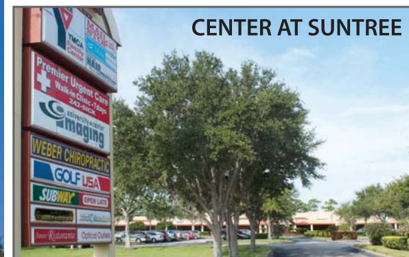
CENTER AT SUNTREE